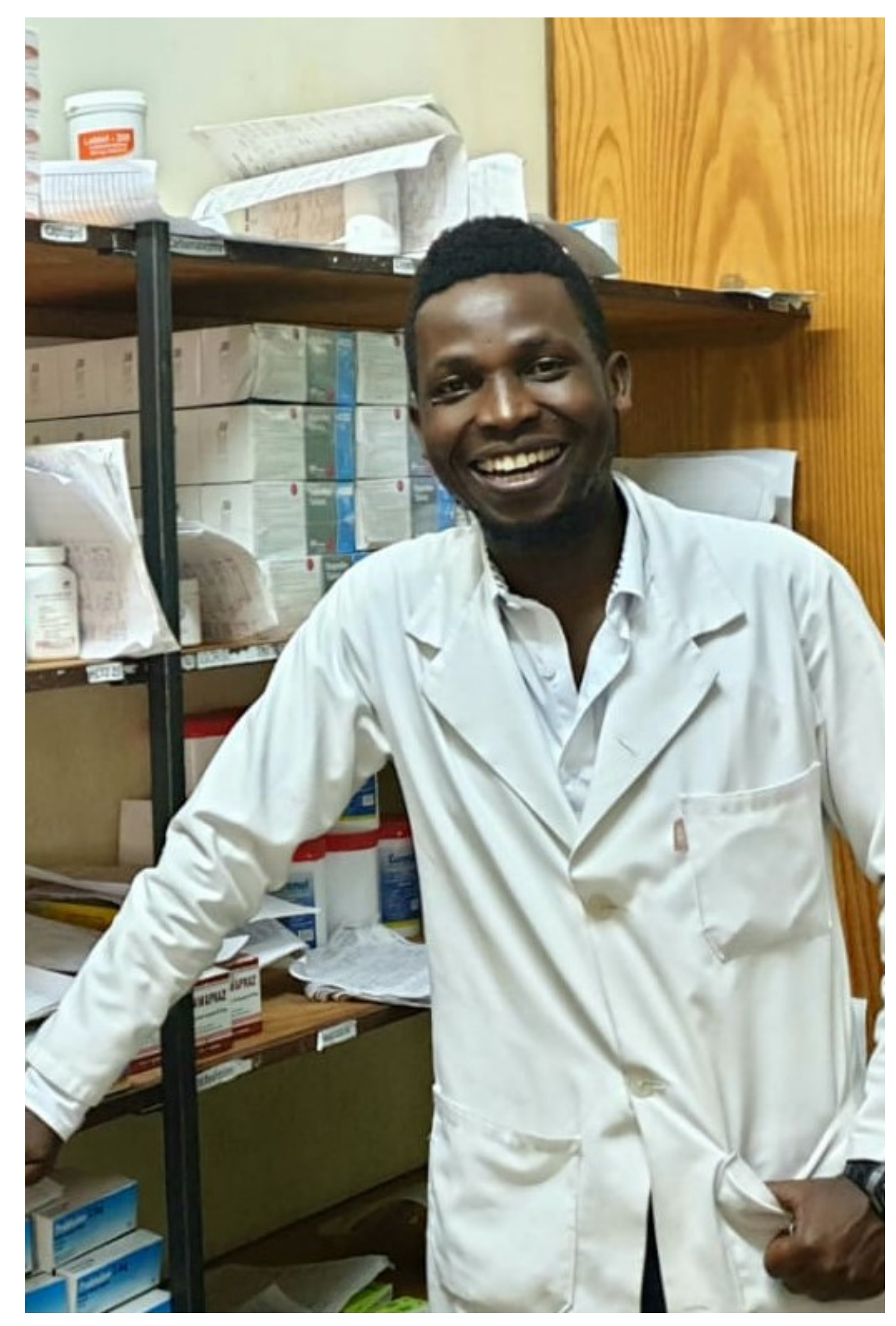
Do you have unused medical items you don't know what to do with?

Inter Care can gift these unwanted items to our partner health units in sub-Saharan Africa